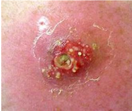
Typical physical wounds -raw,red, angry and spilling puss.